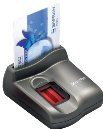
IDEMIA and Secugen PIN Enrolment Reader Options PIV cardholder card + fingerprint + PIN enrolment device