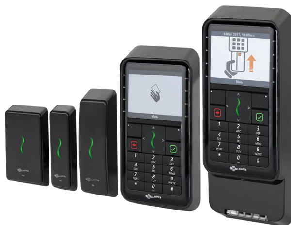
High Sec T-Series Readers Single and dual factor authentication