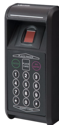
Veridit Stealth Bioreader Triple factor authentication