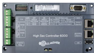
High Sec Controller 6000 Physical access control panel