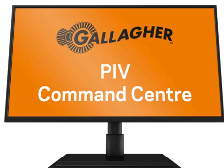
PIV Command Centre Site management control software